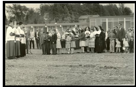
Blessing of a New Church – 1961